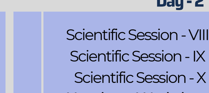
Day - 2